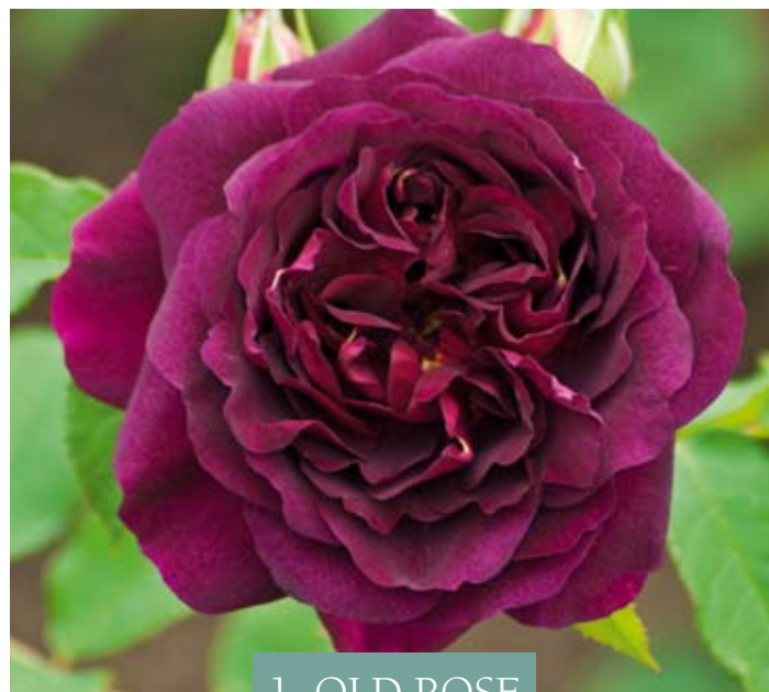
1. OLD ROSE

Parent plants are grown in greenhouses. In early April, at the bud stage, petals are stripped off (top left) and the stamens are harvested, leaving just the stigma. Pollen is taken from the stamen (top right) and applied by paint brush to the stigma of another variety (below left & right). Seeds are extracted in October and kept just above freezing for three months, then sown. Flowers appear in early April. An initial selection is made on flower alone. These are budded onto rootstock out in the field. Over the next eight years, the number of selections is reduced, until the final four or five varieties are chosen for introduction at the RHS Chelsea Flower Show.