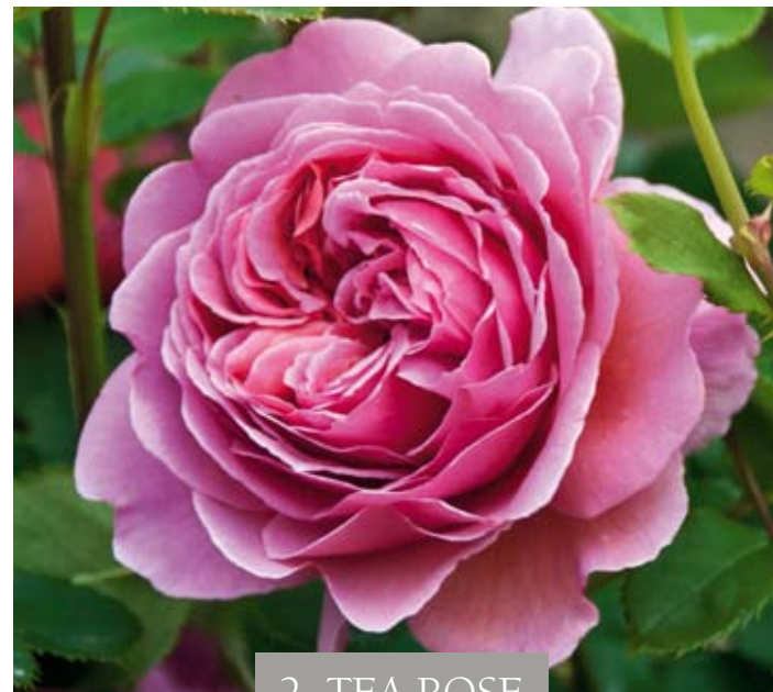
2. TEA ROSE